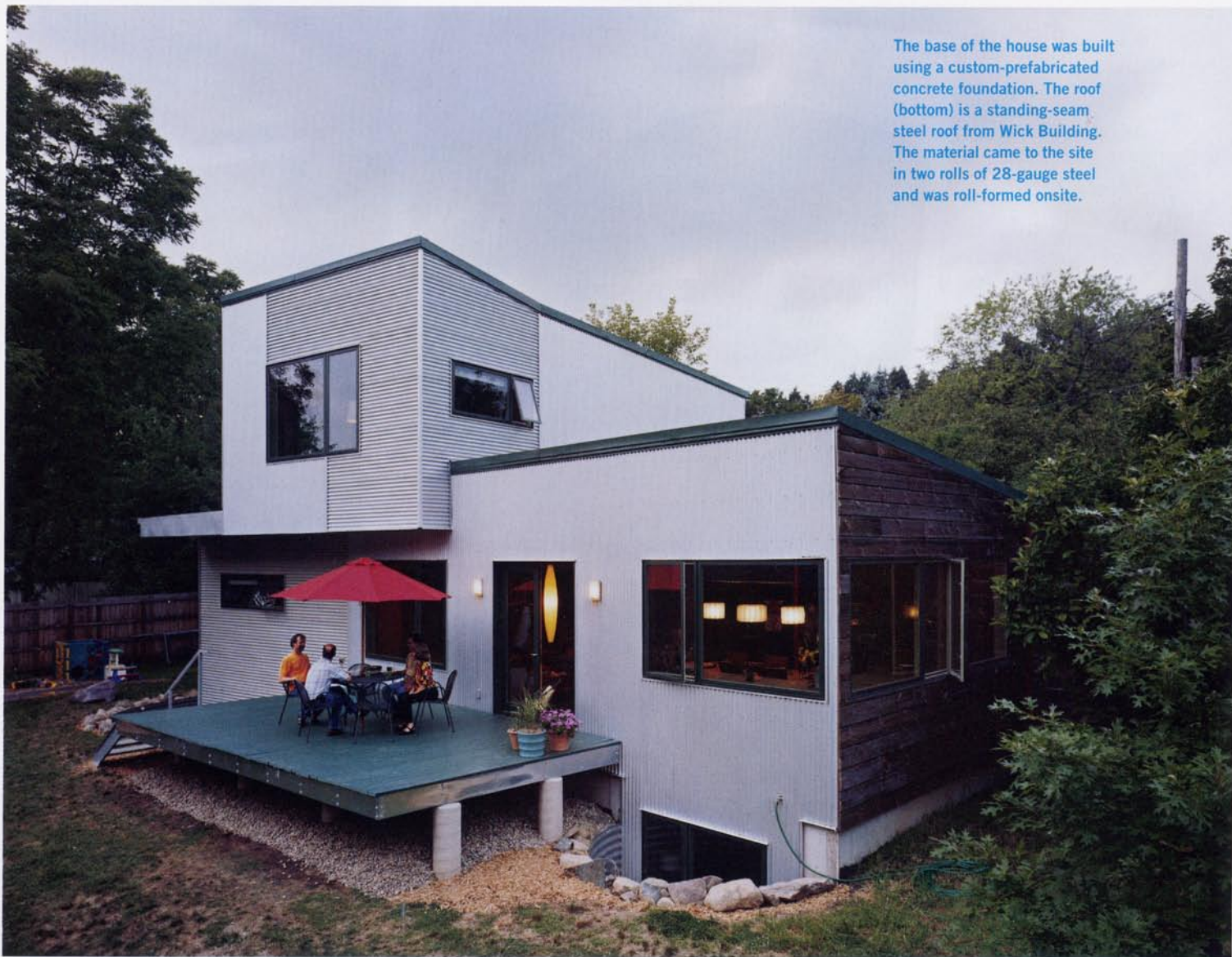
The base of the house was built using a custom-prefabricated concrete foundation. The roof (bottom) is a standing-seam steel roof from Wick Building. The material came to the site in two rolls of 28-gauge steel and was roll-formed onsite.

was based on the maximum solar absorption," Vicari explains. This thinking has led to a home flooded with natural light and also allows for the bare minimum of electricity usage year-round.